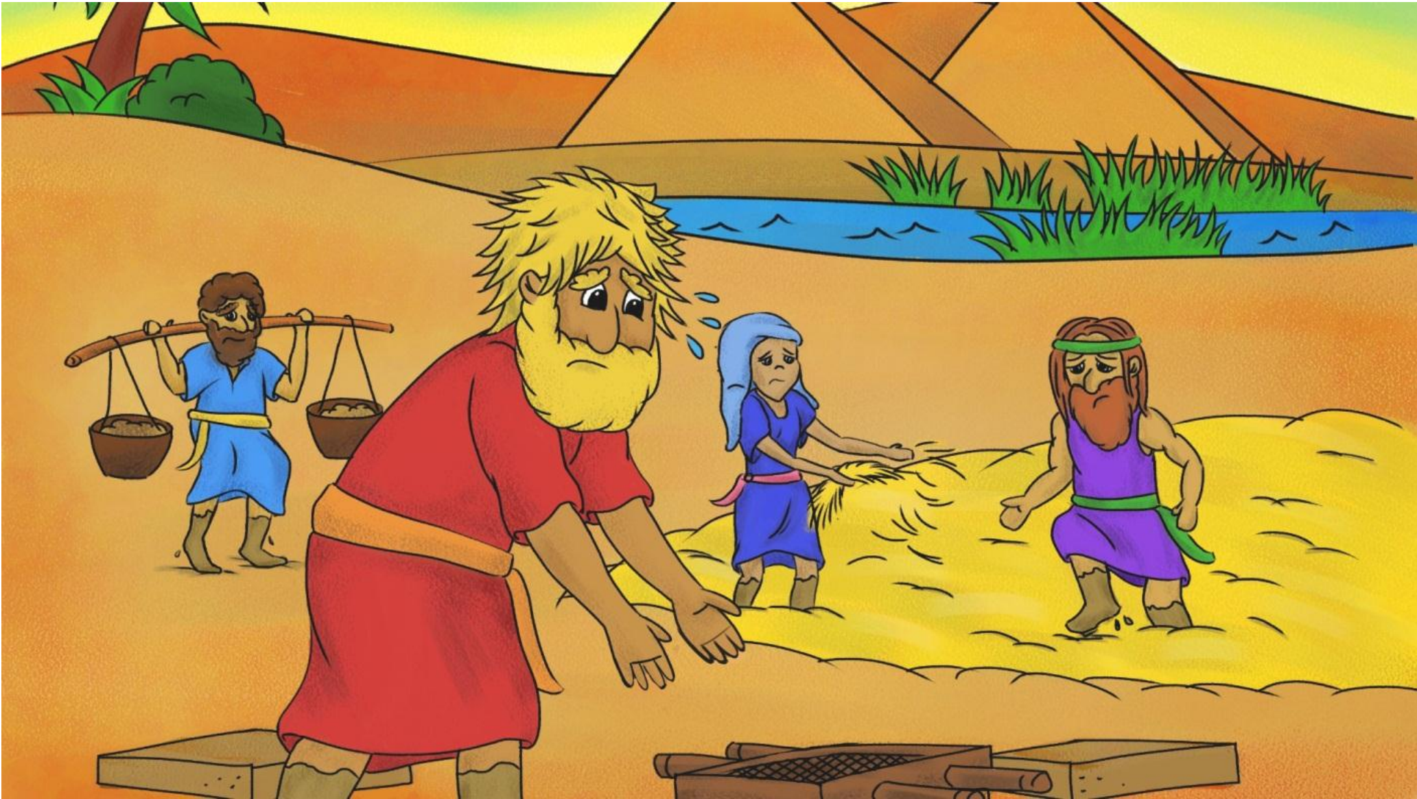
Moses Talks to Pharaoh Exodus 3 - 12