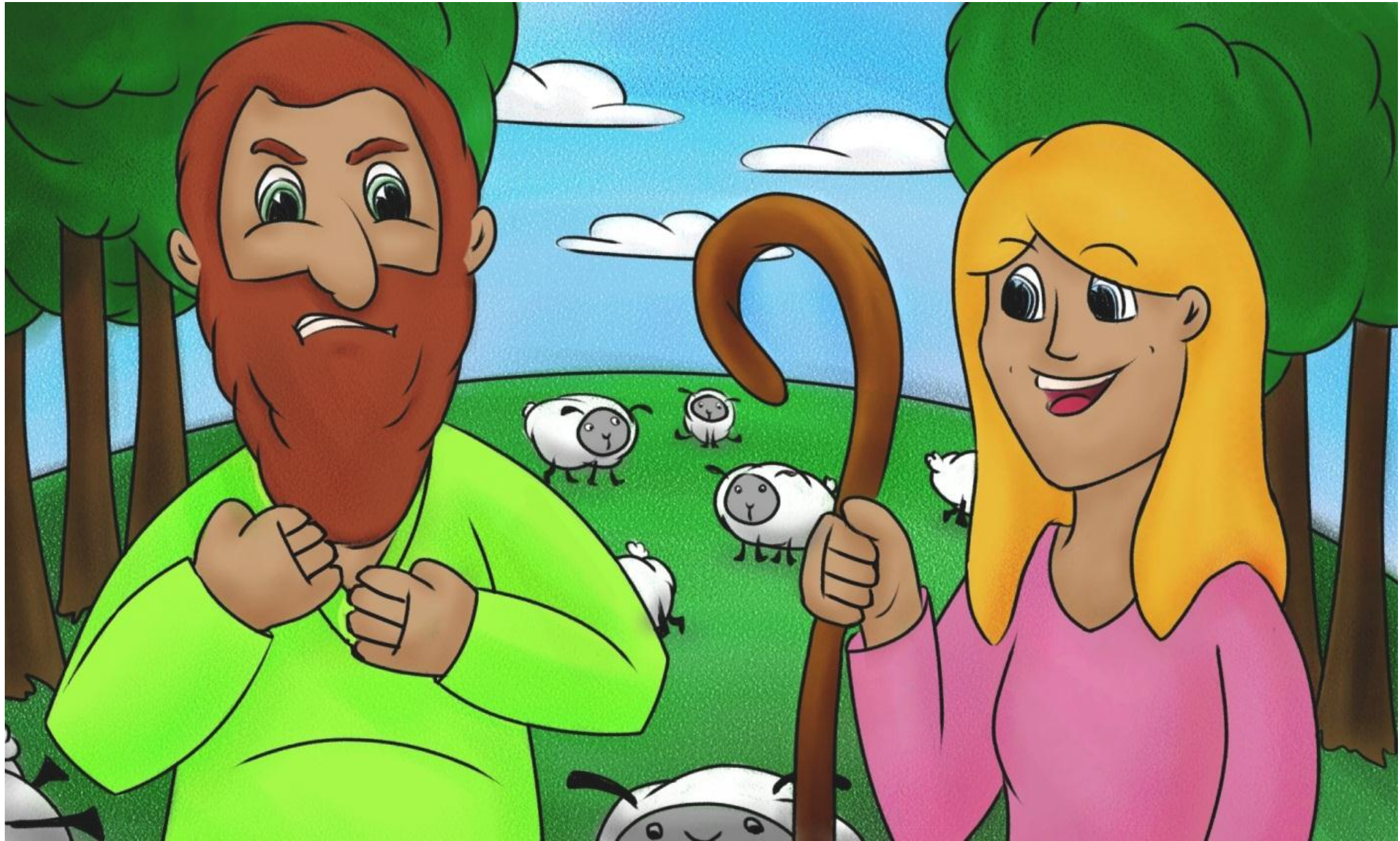
Abigail Shares With David 1 Samuel 25:1-35