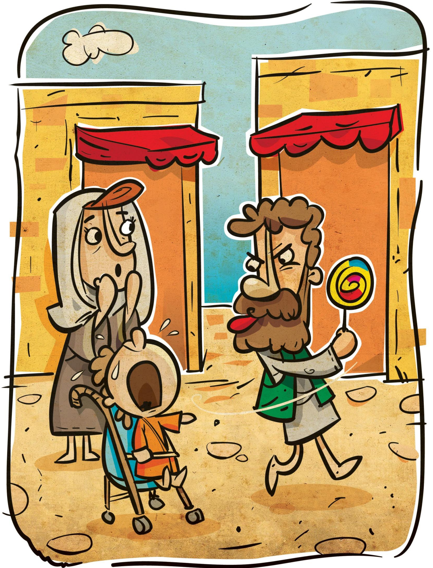
Noah's Ark Genesis 6-9